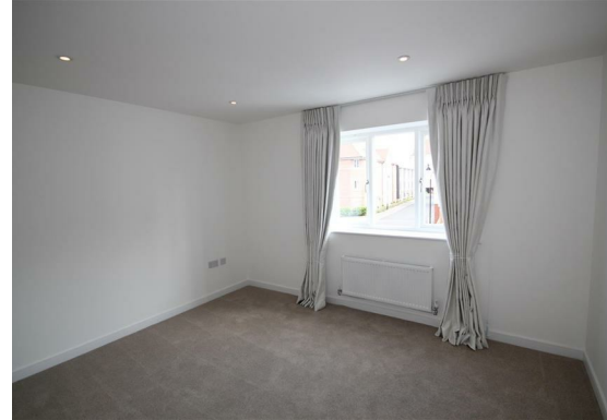
Bedroom 1 12'9" x 12'1" (3.9 x 3.7)